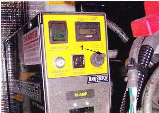
20 K Generator