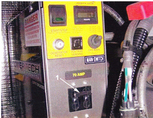
20 K Generator

If the Generator cranks over but will not run when you release the start switch, check the following: